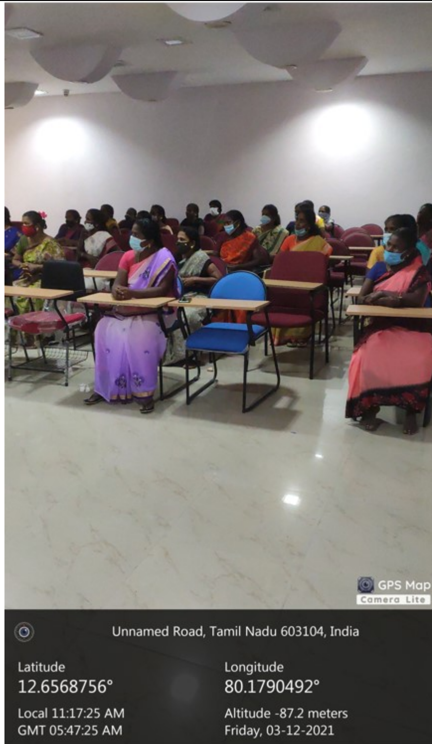
Participants - Support Staff