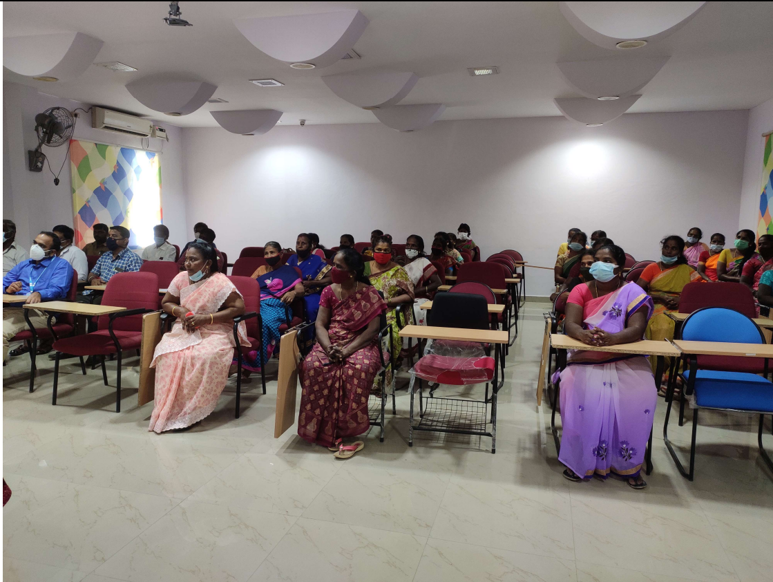
Participants - Support Staff